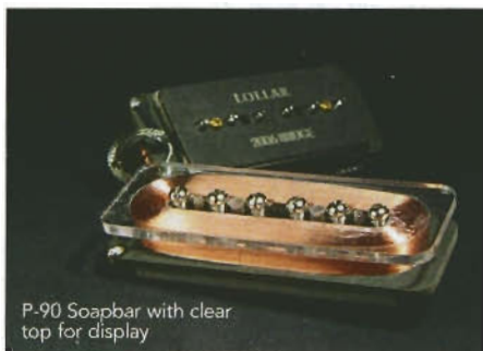
P-90 Soapbar with clear top for display

ries floating around in the boutique pickup world—how can players sort out what is true and what is just marketing speak? Are there any theories or ideas you've heard that strike you as patently untrue?