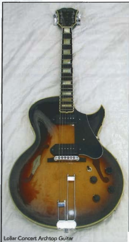
Lollar Concert Archtop Guitar

a spectrum analysis machine. Also, magnets will discharge to various levels after they are put into most types of pickup assemblies. Most old pickups, if you recharge them, will read noticeably higher than before. On most of my pickups, I discharge the magnets partially—various levels of magnetic strength do sound noticeably different. I try to make each pickup design I sell sound as best as it can. I developed all of my line over time, making changes and comparisons to previous versions to really polish the results.