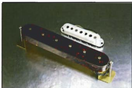
Strat pickup (white) and ES-300 (tortoise) for 1940s-style Gibson lap steels

I use the Crock-Pot you mentioned, actually I have two and they are outfitted with a gasket so I can hook them up to a vacuum pump. Each pickup design I make is put under vacuum for a specific amount of time at a particular wax temperature. The time varies from ten seconds to two minutes, depending on the results I want. I like to have a particular level of microphonics for each pickup design—too much microphonics makes the pickup difficult to use for most players and too little makes